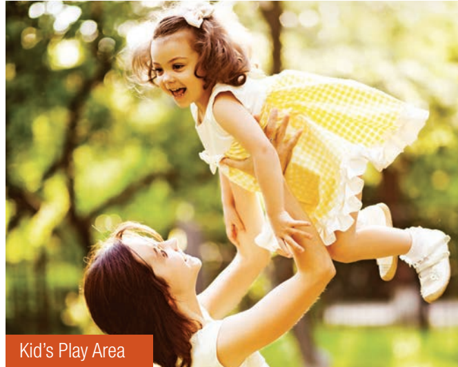
Kid's Play Area