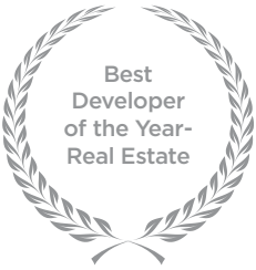
Best Developer of the Year-Real Estate Real Estate and Business Excellence Awards Adsync & CNN 18