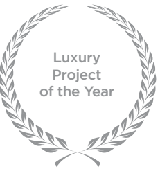
Kalpataru Jade Residences Realty Plus Excellence Awards, Pune 2018