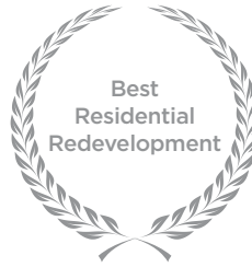
Kalpataru Magnus Asia Pacific Property Awards 2020