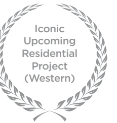
Kalpataru Yashodhan Mid-day Real Estate Icon Awards 2017