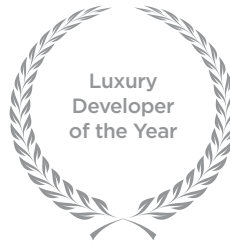
Luxury Developer of the Year Real Estate and Business Excellence Awards Adsync & CNN