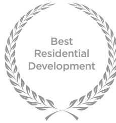
Kalpataru Parkcity Asia Pacific Property Awards 2020