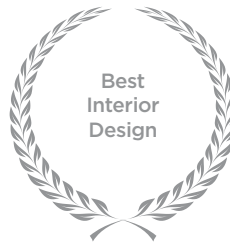
Kalpataru Solitaire Golden Brick Awards 2017