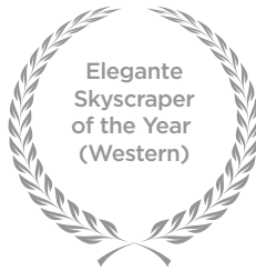
Kalpataru Elegante 13 th Realty Plus Excellence Awards 2021

OUR REAL AWARDS ARE 18000+ HAPPY FAMILIES.