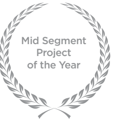
Kalpataru Serenity 11 th Realty Plus Excellence Awards, Pune 2020