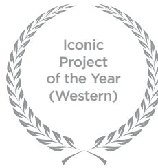
Kalpataru Elitus 13 th Realty Plus Excellence Awards 2021