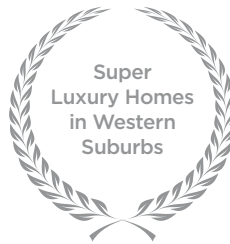
Kalpataru Solitaire Times Realty Icon Awards 2017