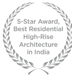
Kalpataru Avana Asia Pacific Property Awards 2017