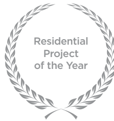
Kalpataru Sparkle Construction Week India Awards 2017