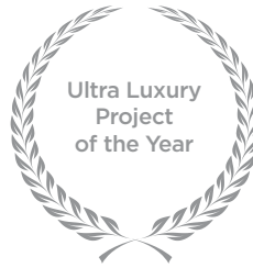
Kalpataru Solitaire CIA World Construction Awards 2020